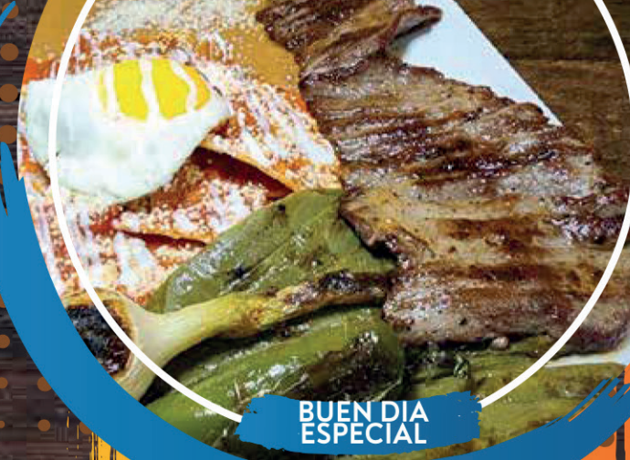
BUEN DÍA ESPECIAL

Birria stew with cilantro and onions 14.99