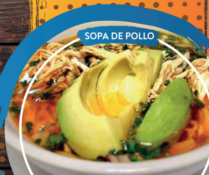
SOPA DE POLLO