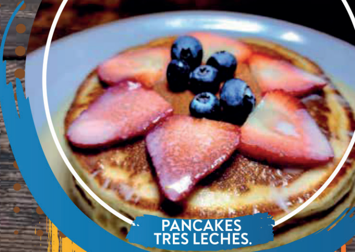
PANCAKES TRES LECHES

2 crispy bolillo bread topped with butter, honey and fruit. Served with caramel or chocolate 6.99