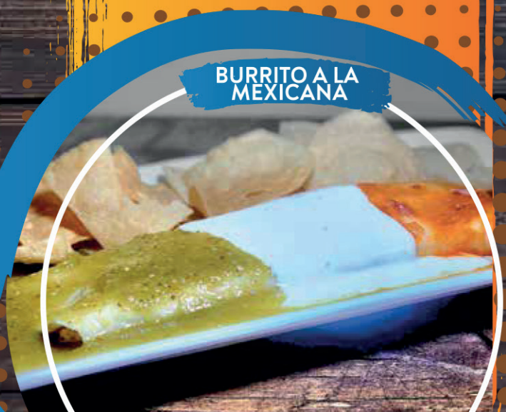
BURRITO A LA MEXICANA

These items may be cooked to order, consuming raw or undercooked meats, poultry, seafood, shellfish or eggs may increase your risk of food borne illness.